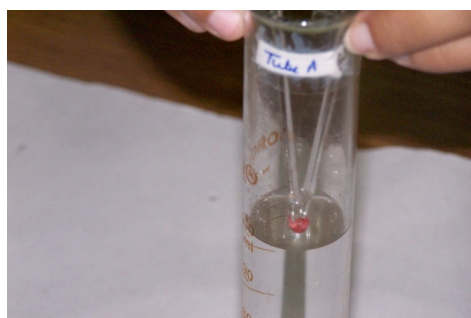
Figure 2: Use of glass stirrers to drop RBC over liquid surface